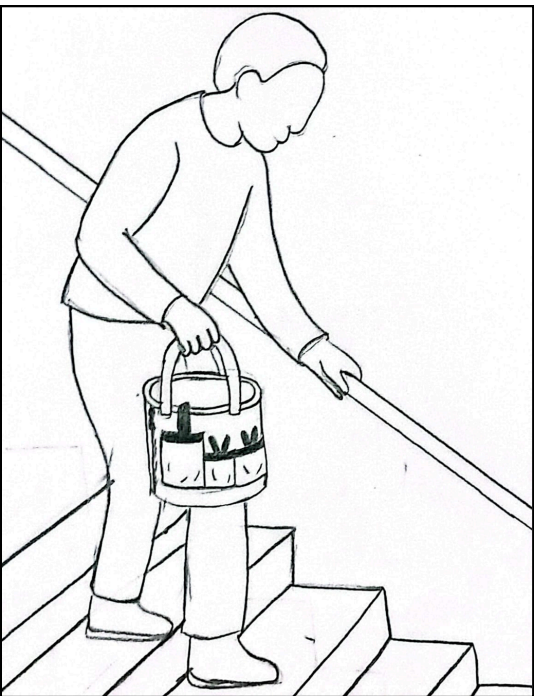
Holding the garden tool bag in one hand allows the elderly individual to use their other hand for support while descending the stairs.