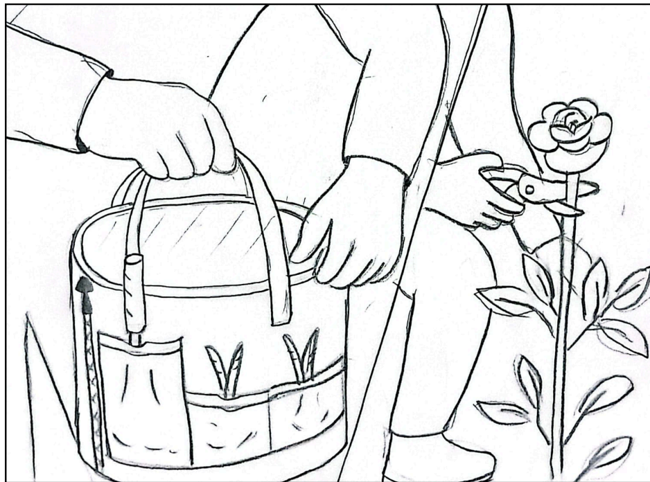
The user removes the pruning shears from the protective pocket and proceeds to harvest the roses.