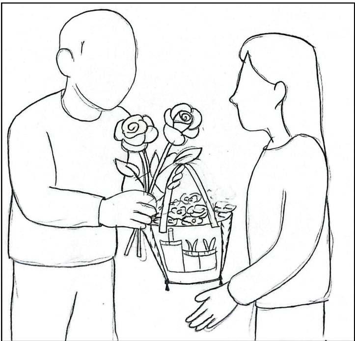
Gifting the roses makes the neighbor happy, allowing them to experience a shared moment of joy in their daily lives.