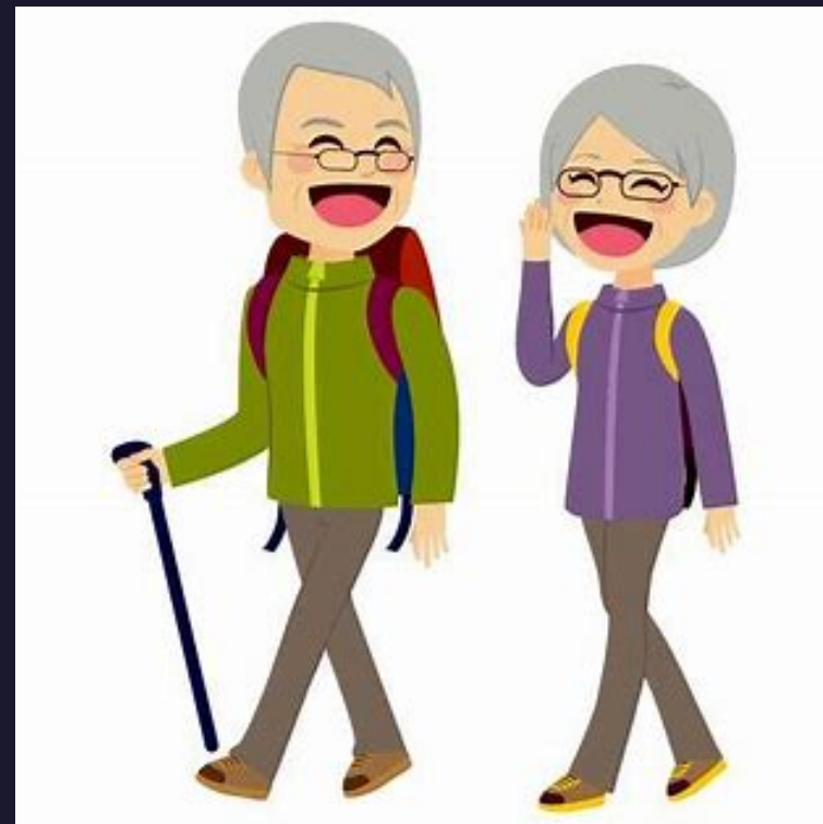
Going on walks